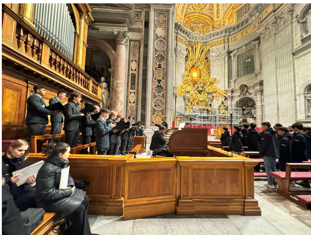
Collegians singing at St Peter's Basilica (Vatican City)