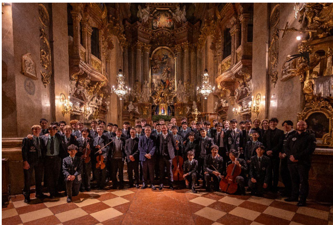
Concert 4 - BBC Music at St Peter's Church of Vienna