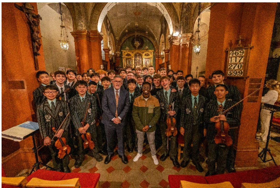
Concert 2 - BBC Music at St Mark's English Church in Florence