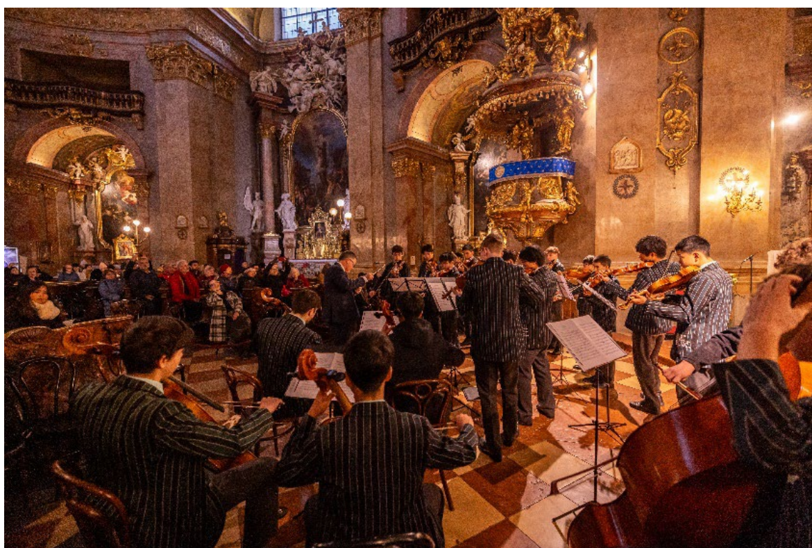
College Strings performing at St Peter's Church of Vienna