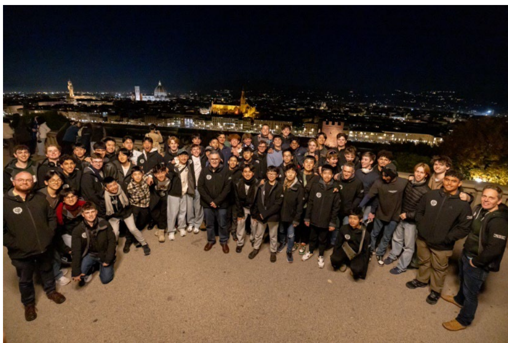
BBC Music at the Piazzale Michelangelo overlooking Florence