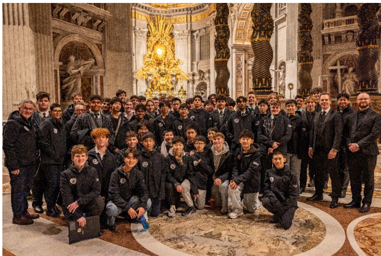
BBC Music in St Peter's Basilica (Vatican City)