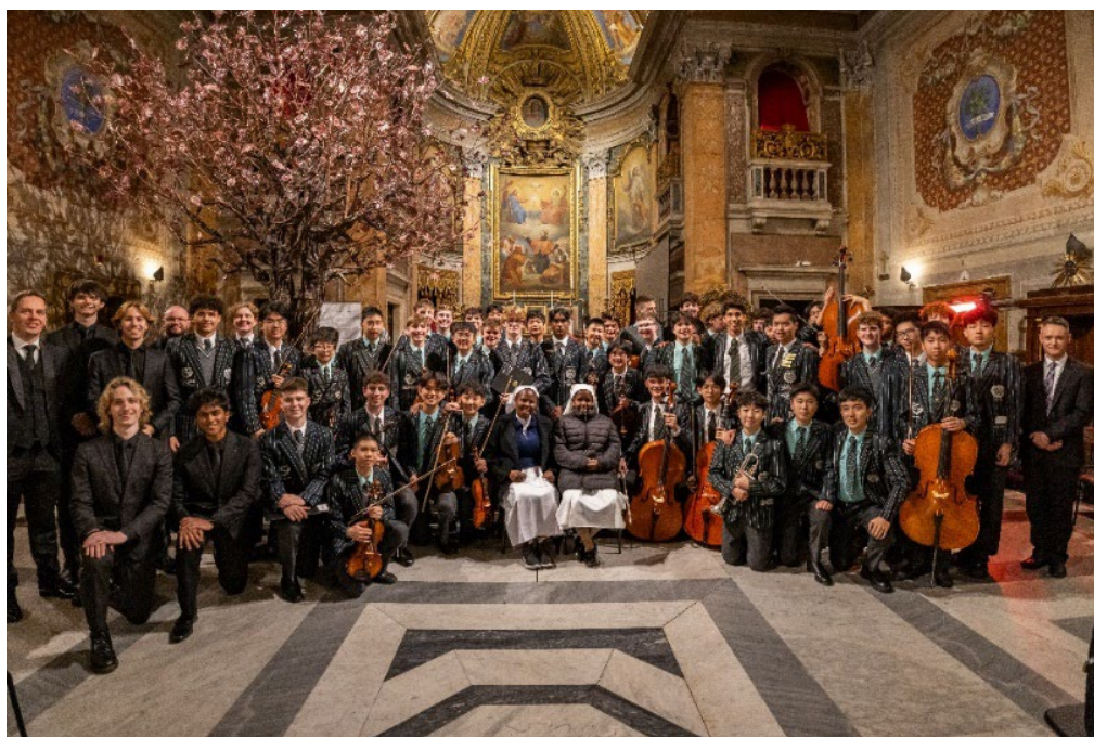
Concert 1 - BBC Music at the Oratoria del Caravita (Rome)