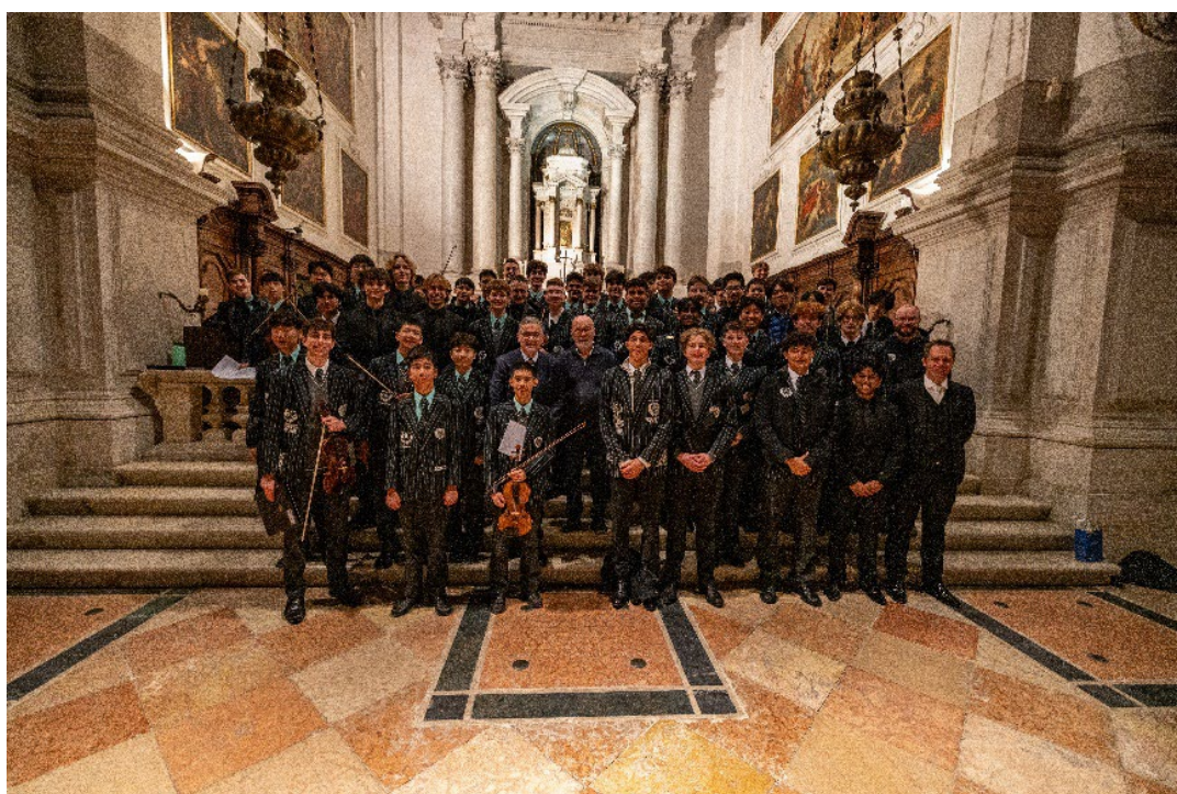
Concert 3 - BBC Music at St Stae's Cathedral in Venice